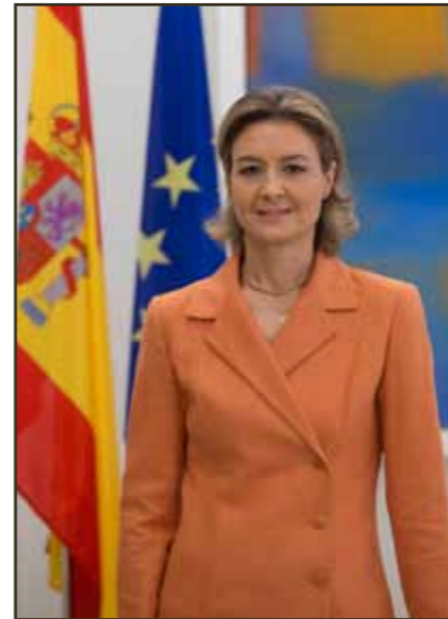
Isabel García Tejerina Minister of Agriculture, Food and Environment Spain

I therefore wish all participants my most warm welcome to Spain, looking forward to be all in Barcelona in March.